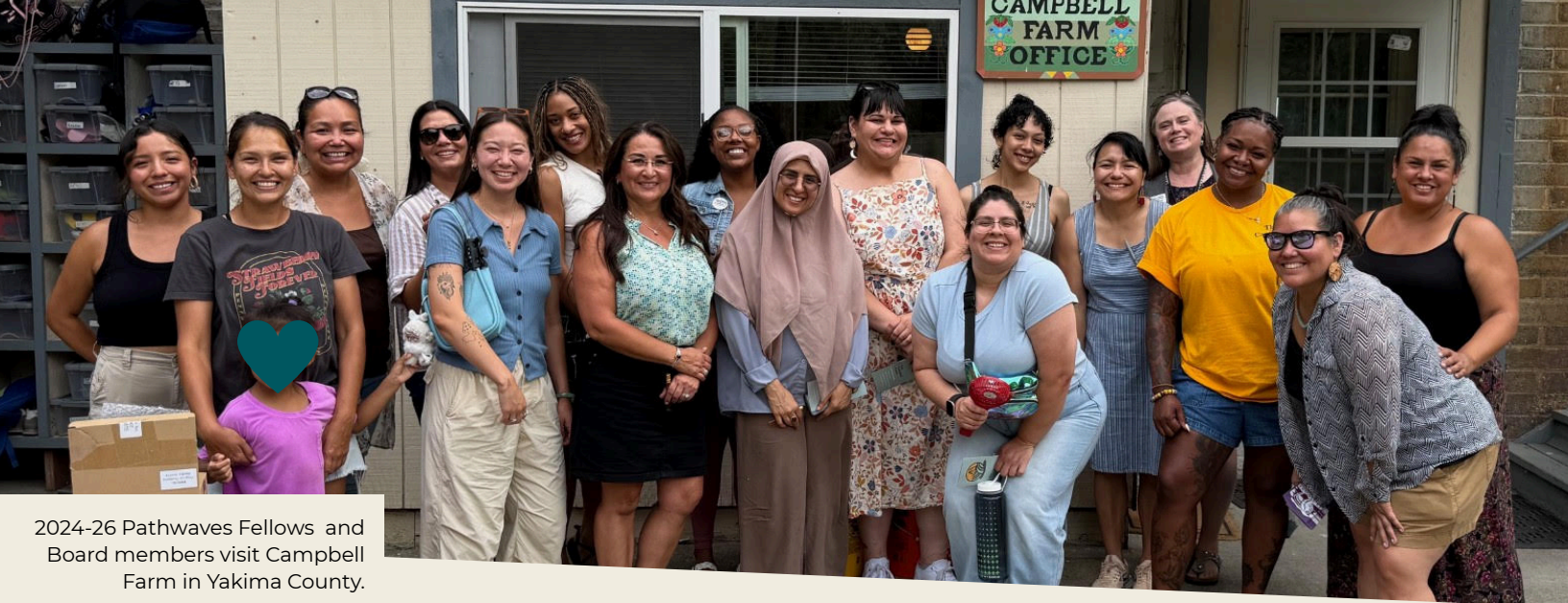
2024-26 Pathwaves Fellows and Board members visit Campbell Farm in Yakima County.