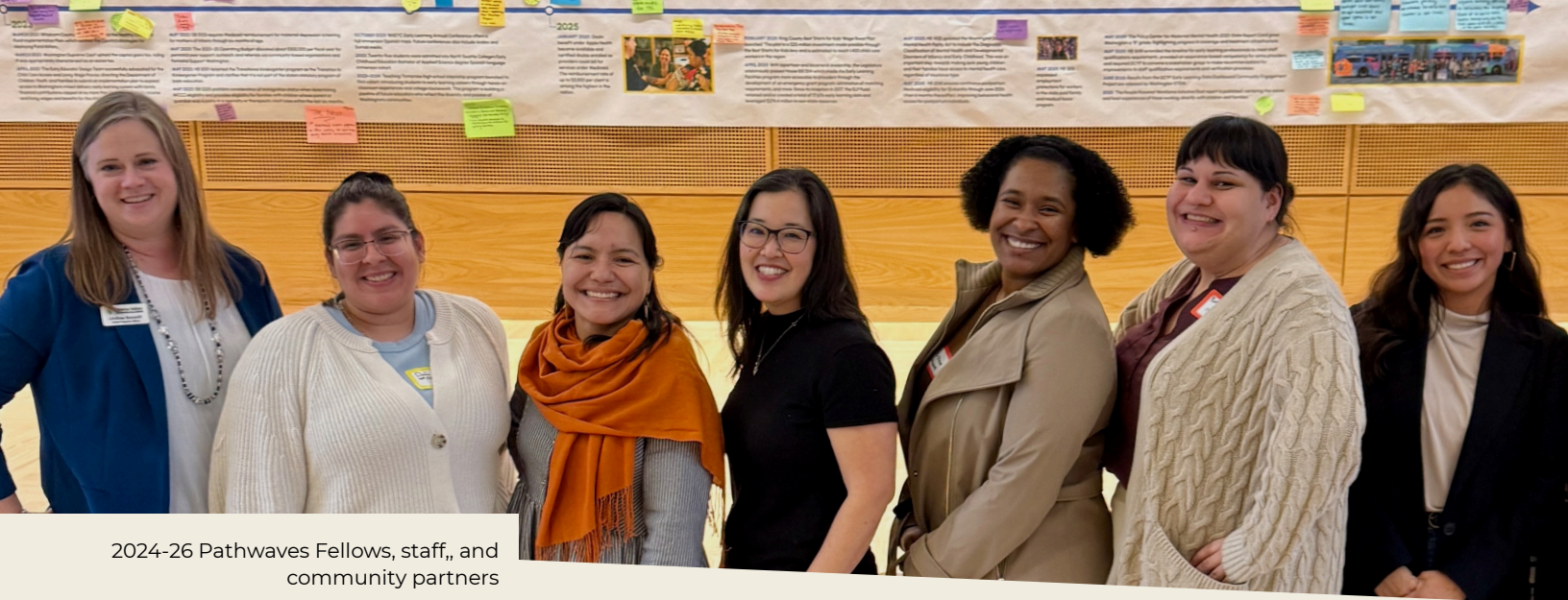
2024-26 Pathwaves Fellows, staff,, and community partners